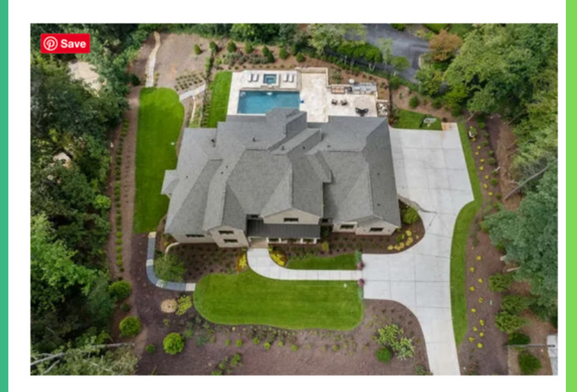
Please note: This is a paid advertisement.